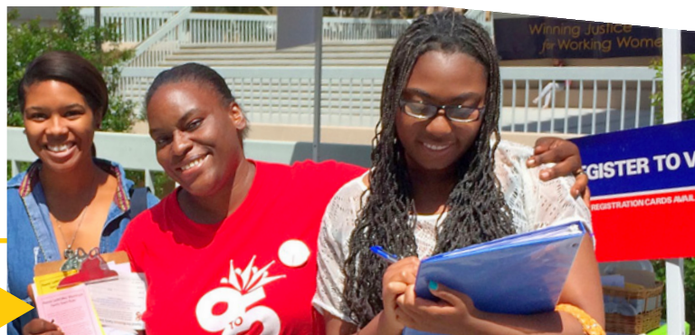
9to5 California leaders register students to vote

9to5 LA joined the Uplift Inglewood Coalition to fight for rent control. In recent years, many Inglewood residents have been forced to leave their homes due to the rising cost of housing. The Uplift Inglewood Coalition drafted an ordinance to prohibit unreasonable, unaffordable increases in rent. Additionally, 9to5 California members went out into the community to register voters.