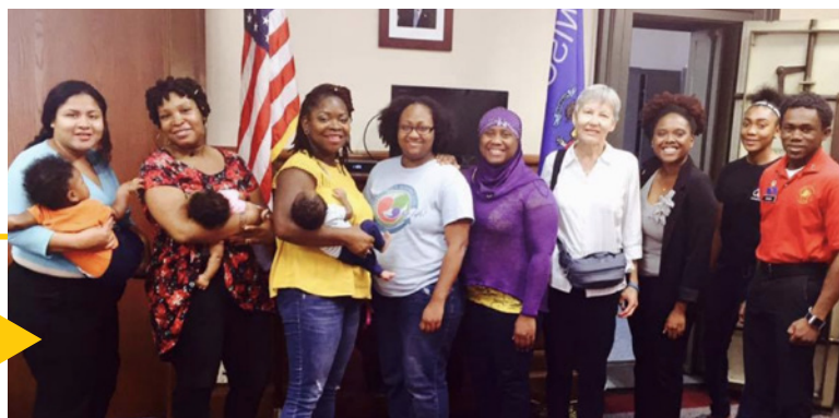
9to5 members taking action for their families at the Wisconsin state capitol.

Wisconsin FMLA is more extensive than federal law, covering in-laws, domestic partners, and part-time workers. Repealing Wisconsin FMLA would take away coverage for employees who work less than 25 hours a week and place restrictions on the ability to use accrued vacation and sick time during what would otherwise be unpaid leave.