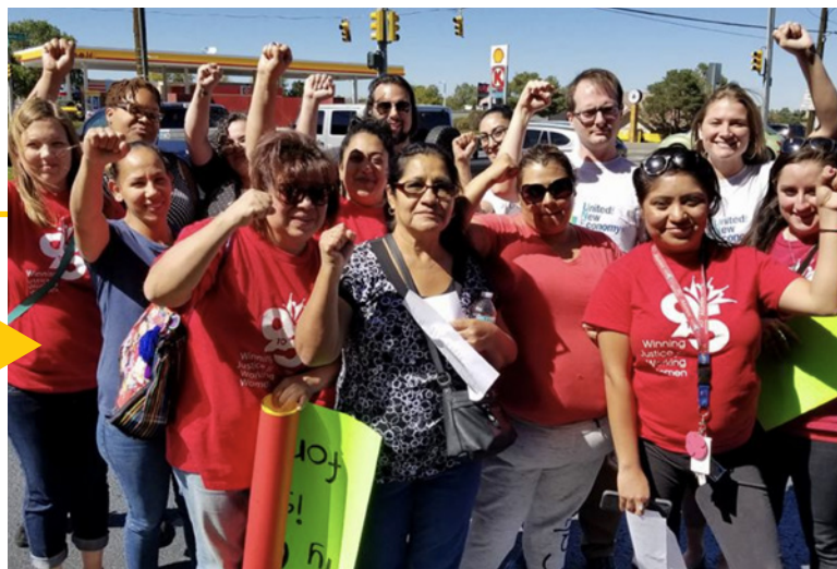
9to5 Colorado leaders fight back against unlawful evictions during National Renter Week of Action.

9to5 is working with coalition partners to create a bus riders union to advocate for an income-based bus pass. This effort saved a bus stop from closing in front of a senior center.